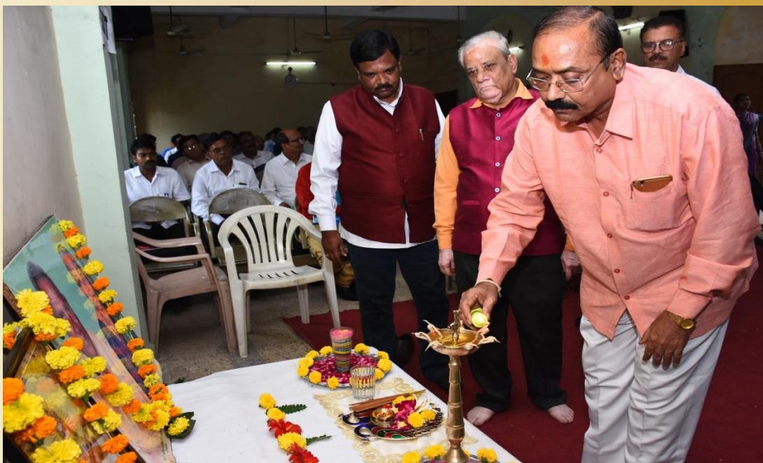
Members on the dais