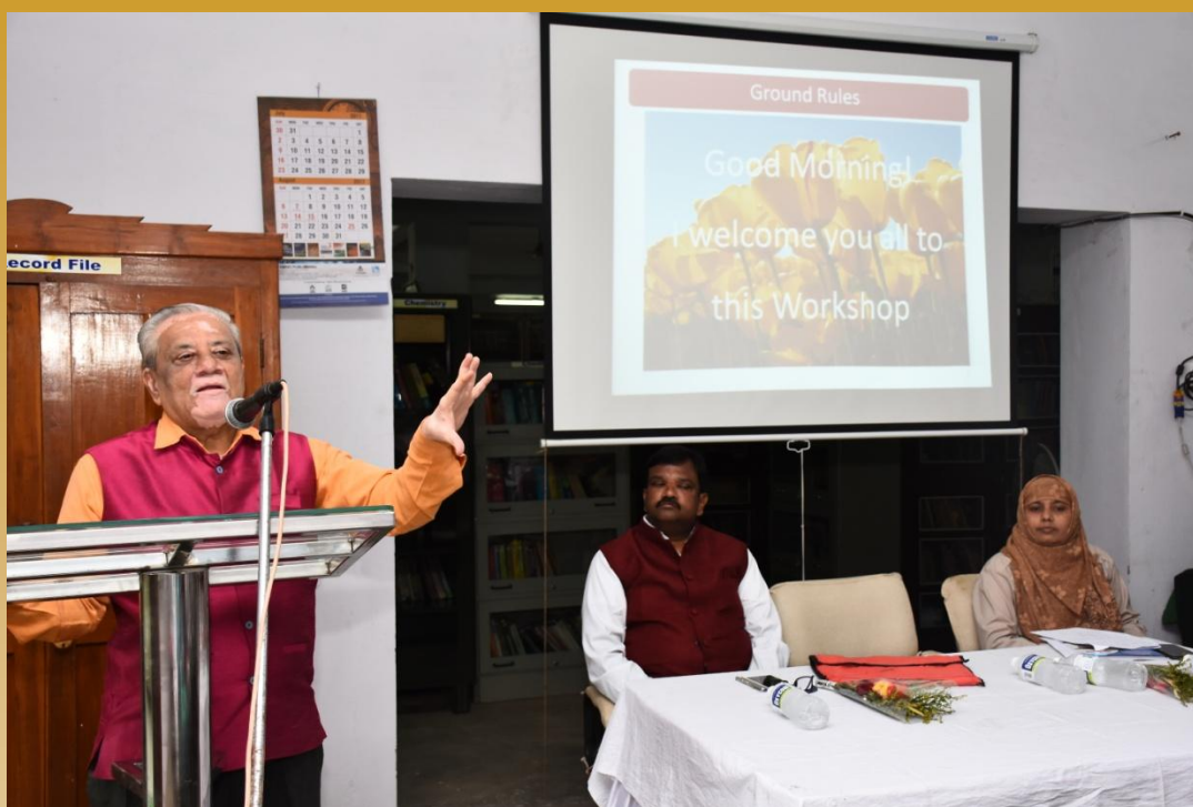
Faculty members sharing their views and problems